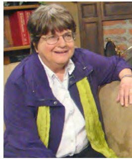
Sr. Helen Prejean, CSJ

This no-nonsense dedicated religious is no fool. She fully appreciates the evil that was done to the victim AND to the victim's family. On the other hand, Sister Helen urges us to listen to the words of Pope John Paul II who tells us we must respect the dignity of all life. Just as there is no dignity in a child being torn out of the womb, so also there is no dignity in a shackled prisoner, being led toward his or her execution. "We human beings," says Helen, "are better than that!"